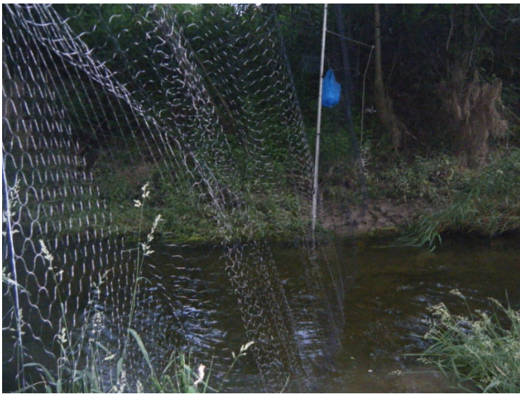
Figure 3: Bat Netting Over a Stream

Mist-netting requires a federal and state-permitted biologist to actively capture bats while they are foraging. Mist-netting occurs between mid-May and mid-August, when bats are active. Biologists monitor the nets for five hours starting at dusk. Mist-nets are set in linear corridors with canopy cover, along forest edges, or over water sources to maximize the number of bats captured (Figure 3). While mist-netting can determine what species occur on a site and probable absence, it cannot determine population characteristics.