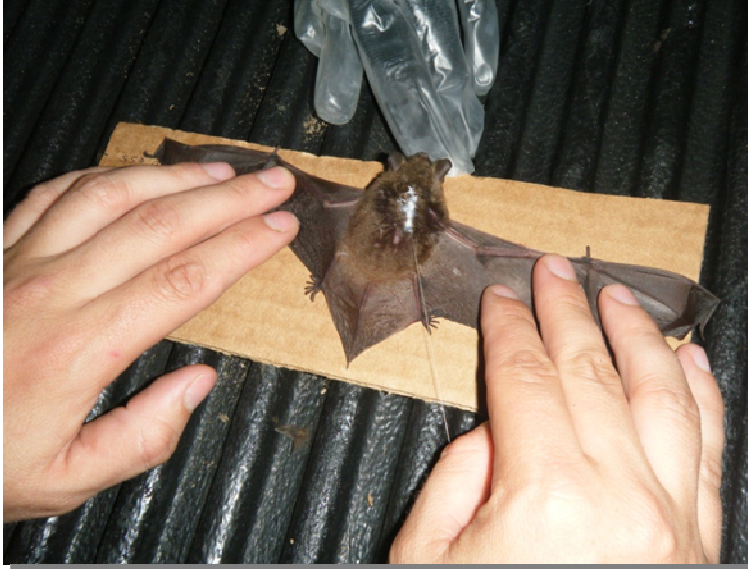
Figure 5: Indiana Bat with Transmitter