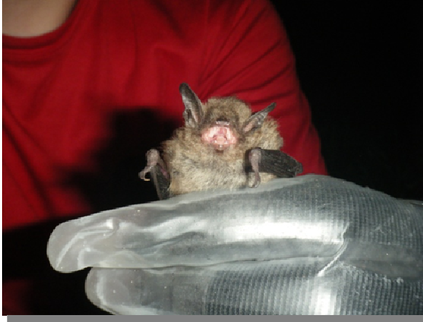
Figure 1: Indiana Bat