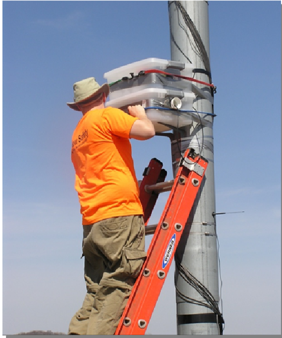
Figure 4: Installing Bat Detectors

Passive acoustic monitoring provides a way to detect and store bat calls over long periods at a stationary site with little effort (Figure 4). Recording data over different seasons may produce a better understanding of what species inhabit a site and at what times of the year they are present.