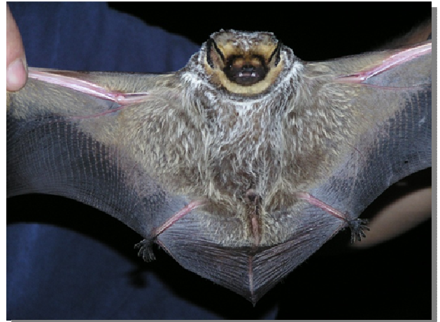
Figure 2: Hoary Bat